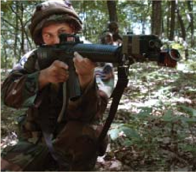
Drawing a bead during squad-level training at Fort Indiantown Gap.