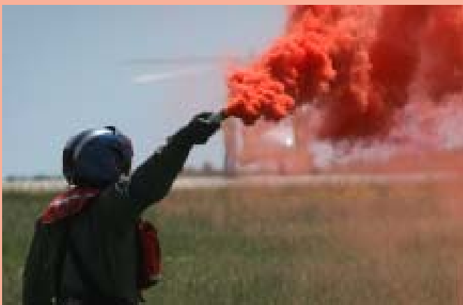
A United States Coast Guard crewmember alerts helicopters to the location of a victim during the exercise.

On Aug. 7, the Department of Military and Veterans Affairs leadership held a follow-up meeting with the federal leadership to discuss further coordination in the event of a natural or man-made disaster.