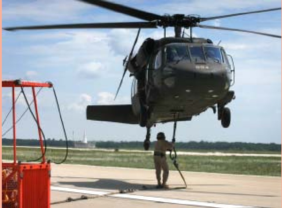
Sgt. Zbigniew Mroczkowski, Aviation Task Force, attaches the cable of a lift basket to a UH-60A Blackhawk during the Hurricane Readiness Exercise at Atlantic City International Airport.

The simulated exercise scenario assumed that a hurricane had struck Cape May County, where a number of civilians had refused to heed warnings to evacuate their homes. The helicopters were used to transport medical personnel and to rescue victims from the disaster scene. In addition, a communications system designed to coordi-