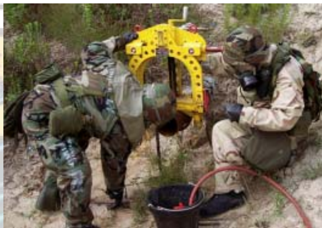
177th Liquid Fuels Airmen repair a fuel line in 80 plus degree heat.

The Power Production team operated and maintained the different emergency generators needed to provide power to the base. They also installed a Mobile Aircraft Arresting System on the airfield to allow fighter aircraft to