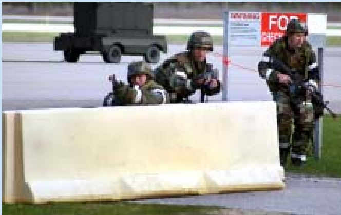
Defending the line: 108th Airmen defend the flightline during a simulated enemy attack.